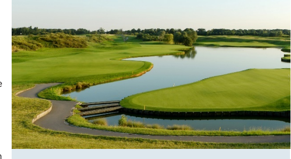
Golf d Étretat