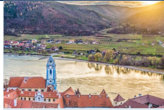
Dürnstein in the Wachau